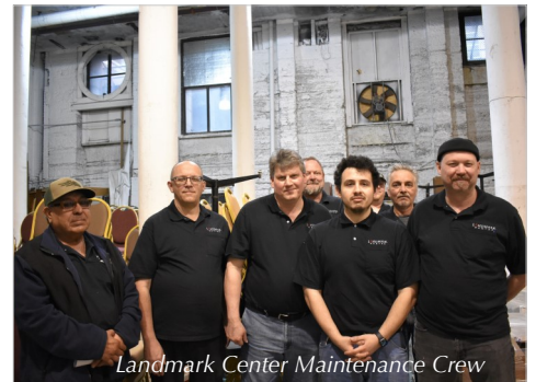
Landmark Center Maintenance Crew

Our maintenance crew has a full plate keeping Landmark Center fresh and clean, set up for events and keeping the grounds clear and safe. (The past winter was a challenge for snow removal!) Our major building projects