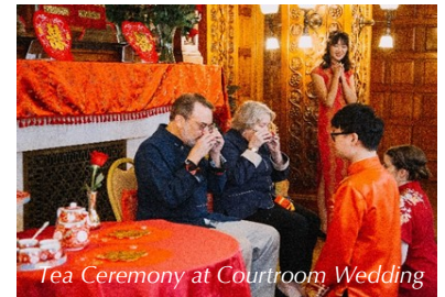
Tea Ceremony at Courtroom Wedding